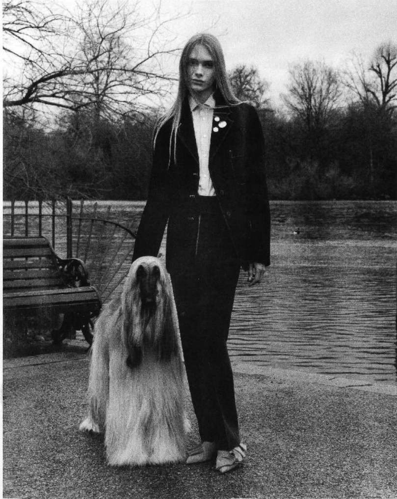
Dog days: JW Anderson's napa-leather ruffled boots add flair to a black trouser suit and hint at a more coltish side Black denim blazer, £740; Lemire, Striped cotton shirt, £175; Turnbull & Asser; Black silk-canvas trousers, from £730; Gollac; Leather boots, £535; JW Anderson; Silver badges, from £135 each; Yellow-gold badge, £1,500; All Timmy, at Dover Street Market; Drop earrings, £3,420; Ron Arad, at Louisa Guinness Gallery